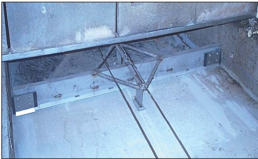
Figure 1. Scraper system used to remove manure produced on a daily basis

Two identical grower-finisher rooms at PSCI were used for this experiment. A total of 70 pigs per room were used at a starting weight of about 21.5 kg and remained in the rooms for 12 weeks for each trial. A manure scraper system (Fig. 1) was installed in one room (Scraper). The other room (Control) was operated normally, i.e., manure was allowed to accumulate in the pits, and was drained on a predetermined schedule by pulling the pit-drain plugs.