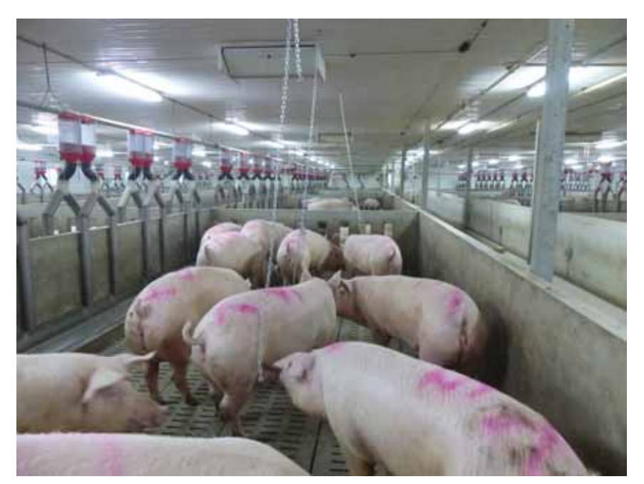
Sows explore multiple enrichments as part of an SIP demonstration project

While straw is known to be a preferred enrichment for pigs, it can be difficult to provide in fully slatted systems. On partial slats, a small quantity of straw can be provided on solid areas, or in a rack or hopper, and will generally be consumed