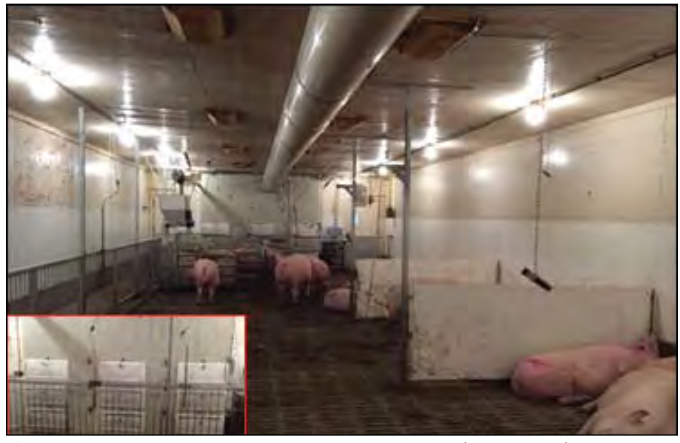
Figure 1. Photos of the control room with the existing (unmodified) ventilation system (A) and the treatment room with the air inlets on the opposite side (B) following the principle of a horizontal flow ventilation system. B – inset: wall air inlets installed in the treatment room.

Figure 1 shows the ventilation design configuration of the two experimental rooms. In the Treatment room, air inlets are located on one side of the room and exhaust fans are on the opposite side allowing air to flow horizontally through the entire length of the room (Figure 1b). In the Control room, inlets are located on the ceiling while the fans are on one of the external walls; this configuration represents a downward air flow direction which is typical in commercial sow barns (Figure 1a). Each room has inside dimension of 23.1 ft (w) x 65 ft (l), two electronic sow feeders, four nipple drinkers, and housed 40 sows, on average, throughout the study.