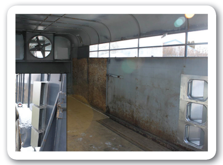
Figure 2. Ventilation fan and air filter holder were installed in gooseneck area which was partitioned from the animal compartment of the trailer. Exhaust vents (inset) were installed on both sides of the trailer.

Comparing the percent reduction achieved by the two filter types, MERV 16 filters were not significantly different (p=0.695) from the fabric bag filters.