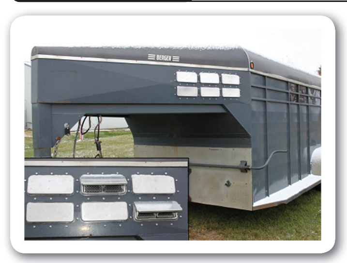
Figure 1. Commercial swine transport trailer with installed air inlets (inset) for the air filtration system.