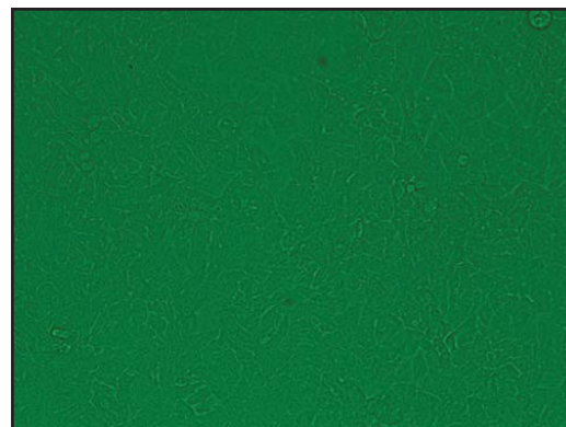
Figure 2 Image showing no infection (cytopathic effect) in the Vero 76 cell culture in the 6-well plate incubated with Cu-NP. A clear monolayer of cells is visible.