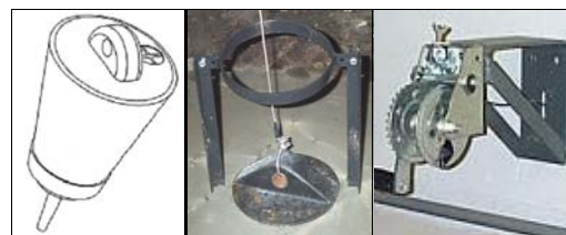
Figure 1. Improved pit-plug design showing the (a) extended cone plug, (b) with cable attached and plug-height stop, and (c) the cable-winch system for remotely pulling the plug from outside the room.

After examining several plug designs, the extended cone plug was selected and installed. Monitoring of H 2 S