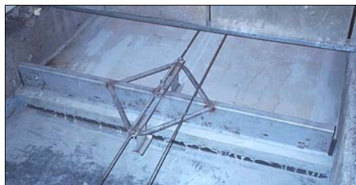
Figure 3. Scraper blade used for daily removal of manure from the pit. The manure pit has drains at both ends, through which the scraped manure was emptied to the sewer line.