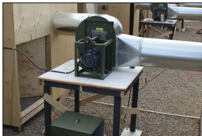
Figure 2. Actual installation of air cleaning unit at a grower finisher room