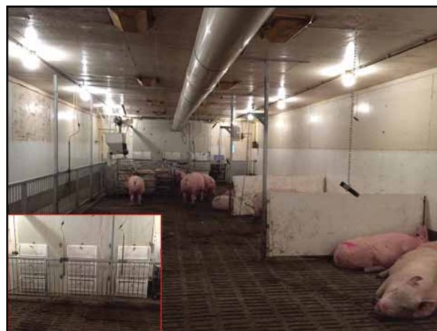
Figure 1. Photos of the control room with the existing (unmodified) ventilation system (A) and the treatment room with the air inlets on the opposite side (B) following the principle of a horizontal flow ventilation system. B – inset: wall air inlets installed in the treatment room.

monitoring points in the animal-occupied zone (AOZ) had HRE values greater than 1 which indicate that the air was homogeneously mixed. During winter period, in the model, all HRE values decreased which could be attributed mainly to the lower ventilation rates maintained in the rooms during the cold season. However, HFVS still had HRE values greater than 1 in all 9 monitoring points and the highest average HRE among all the designs tested for winter. Therefore, this ventilation system configuration (horizontal flow ventilation system) was selected for the subsequent in-barn evaluation.