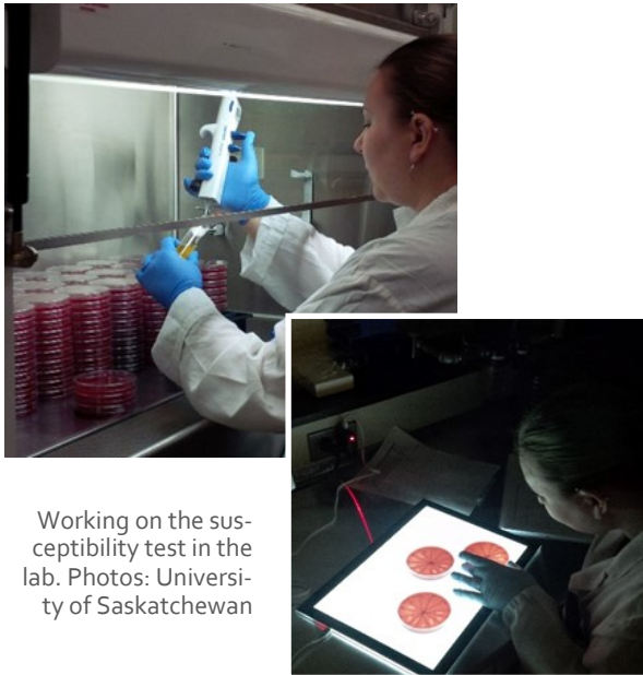
Working on the susceptibility test in the lab.

this age of growing focus on social license, that could prove a vital shot in the arm for industry.