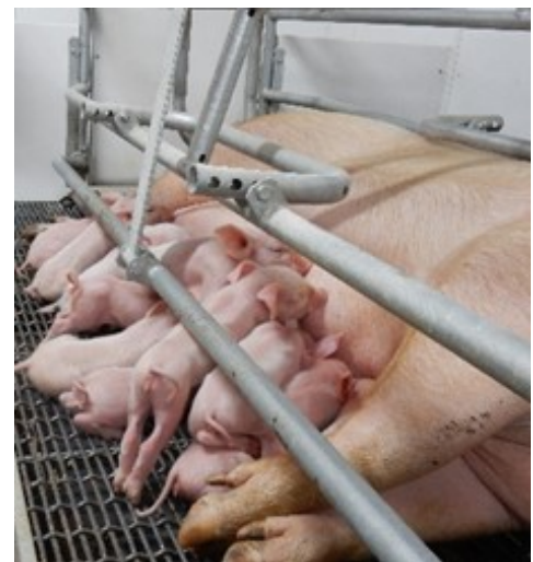
Suckling piglets.