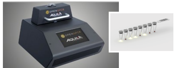
On-farm testing instrument.

For more information, contact David Alton, Aquila Diagnostics System at david.alton@aquiladiagnostics.com