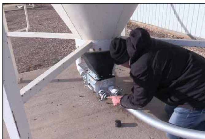
The feed bin boot and auger with motor are important components of the feed system that need regular maintenance

The feed system is one of the most important components to regularly check and maintain. The main components are the bin boot, the auger / auger motor, switches, and feed line. Basic maintenance of the feed system includes regularly greasing boot bearings, checking oil level in the gearbox and changing it if necessary, and checking for overall wear and tear. Auger motors require monthly lubrication. One of the biggest mistakes with feed systems is overfilling it, causing system components to stretch, wear out and break down more often. Proper use of proxy and delay systems will avoid having the feed system always full.