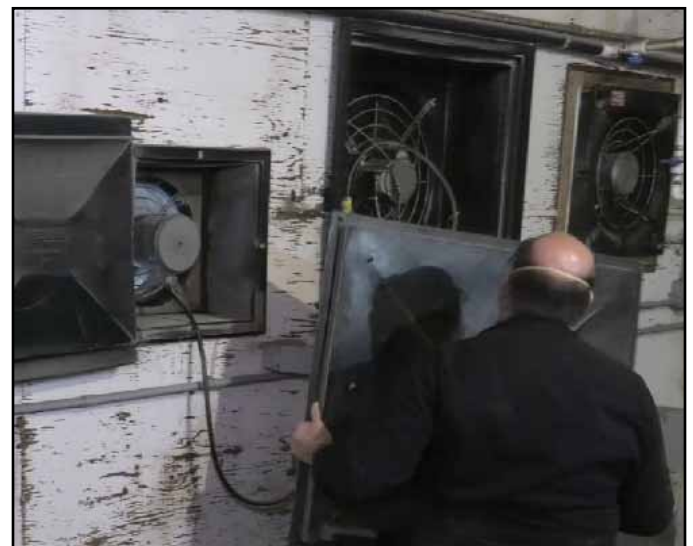
Getting the ventilation system ready for winter

A good relative humidity (RH) in the barn is around 60%. If RH is below 50%, ventilation rate is too high, wasting energy. For example, increasing the ventilation rate by 40% above the proper ventilation rate doubles your propane or natural gas use. Over-ventilating in the winter also expels heat, resulting in increased heating, thereby wasting more energy. A whopping 80 to 90% of heating energy is lost through the ventilation system, so it is important to use correct controller settings and ensure the correct fan size for each room and stage. Both can have a big influence on energy use. Do not try to winter ventilate a large room with several slowly operating variable speed fans. One properly sized fan running at its recommended speed is the most energy efficient.