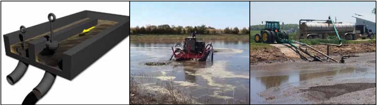
Energy is used when slurry is pumped from the barn to the outdoor storage facility (left), when slurry is agitated in the storage facility (middle), and when slurry is loaded and transported for field application (right).

Manure pits in barns not only collect manure, but water wasted by pigs from drinkers and water used for cleaning. While we require some liquids to move the manure from the barn to an outdoor storage facility, slurry can include approximately 40% clean water wasted from drinkers. This is more water than required for easy flow, rather increasing wastage and manure produced.