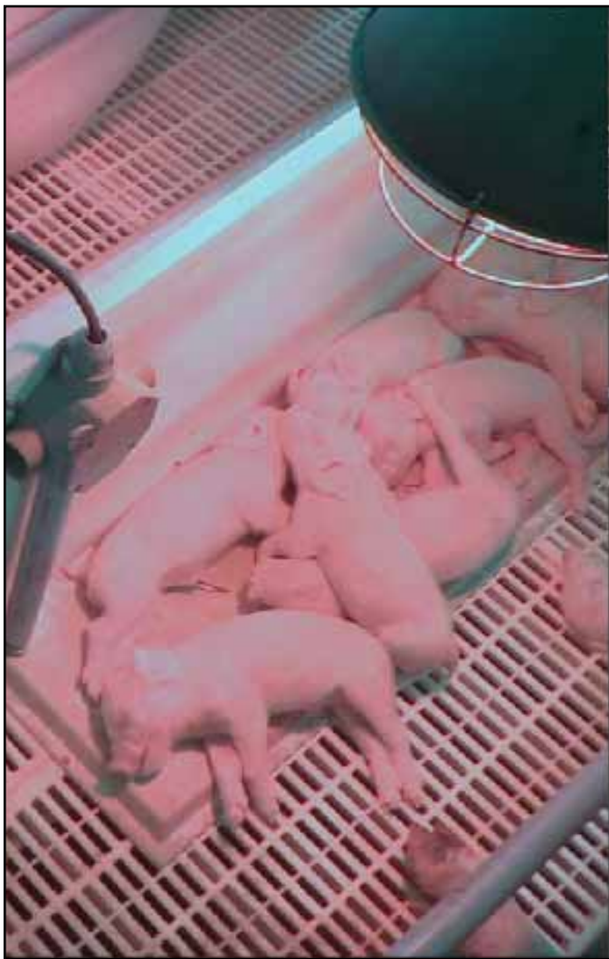
Heat pad and heat lamp

In the first week post-weaning, additional heat may be useful through heat mats, heat lamps, or radiant heat brooders. A brooder is similar to a heat lamp, but is bigger, and powered by natural gas or propane instead of electricity. Additional heat sources are especially important in wean-to-finish barns where we house pigs of all ages in the same room. When using brooders or heat lamps, place a rubber mat on the floor below it. Radiant heat provides heat directly to the animals. Colour impacts radiant heat transfer, so simply measuring the temperature of the black mat will not tell you what the temperature is like for pigs. Whereas the black mat absorbs most of the radiant heat, the tan-colored skin of pigs will reflect a certain amount of the radiant energy. As a result, the lying pattern of the pigs will need to be your guide whether the area under the brooder is providing the proper temperature.