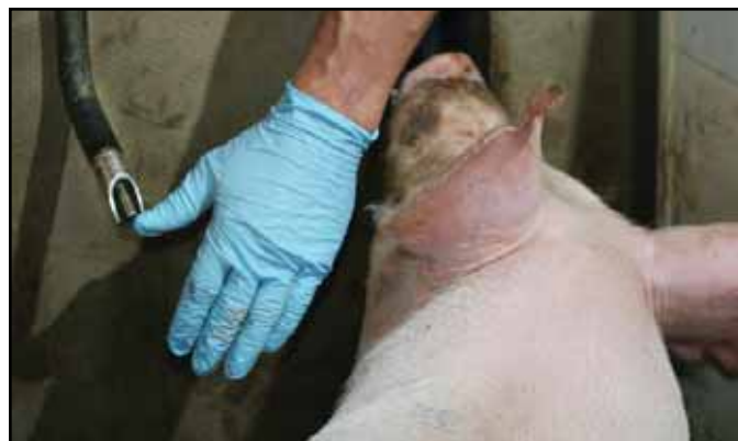
Well-managed nipple drinkers can effectively reduce water wastage