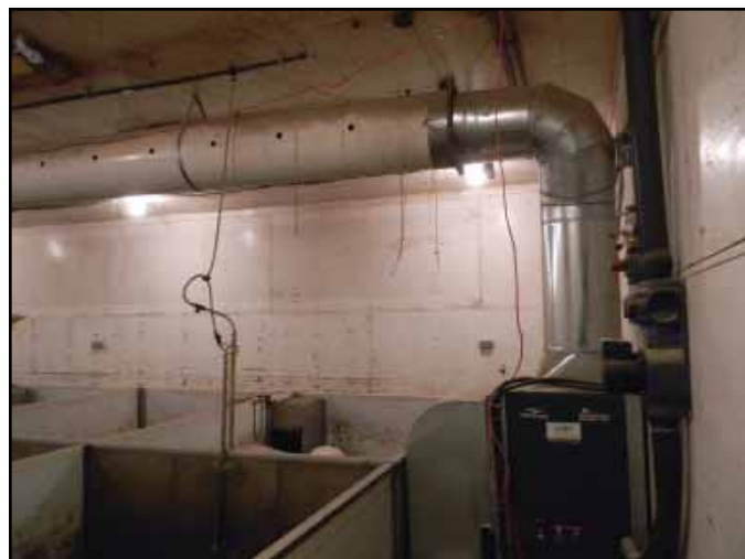
Geothermal heat pump installed in a grow-finish room at the Prairie Swine Centre

A geothermal system utilizes the constant temperature of the ground to provide heating and cooling to buildings. The geothermal system, or alternatively known as ground source heating system is composed of a heat pump and a series of connected polyethylene pipes buried in trenches (vertical or horizontal) in the ground outside the barn, forming a closed loop. The buried pipes contain a solution that absorbs or deposits heat from the ground, depending on whether the outside air is colder or warmer than the soil. When air temperatures are colder than the ground, a geothermal heat pump removes heat from the collector's fluids, concentrates it, and transfers it to the building. When air temperatures are warmer than the ground, the heat pump removes heat from the building and deposits it underground. Conventional ductwork distributes heated or cooled air from the geothermal heat pump throughout the building. Heat pumps are usually electric powered, providing three to four units of heating energy for every one it uses for operation. This gives a geothermal system up to 400% efficiency rating on average. Geothermal systems have a high initial cost, but the underground loop systems last up to 50 years.