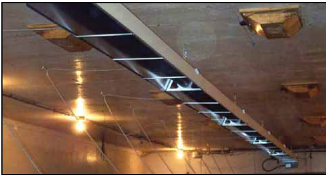
Infrared radiant tube heater

Infrared heaters reduce required heater output sizing by 15-20% compared to forced air systems. Radiant tubes can also control humidity resulting in possible energy savings when considering minimum ventilation rates. A PSC research trial showed that infrared radiant heaters consumed 60% less natural gas than a forced-air convection heater in a grow-finish room. The infrared radiant heating also provided more uniform heat distribution and had no adverse impact on the growth performance of the pigs.