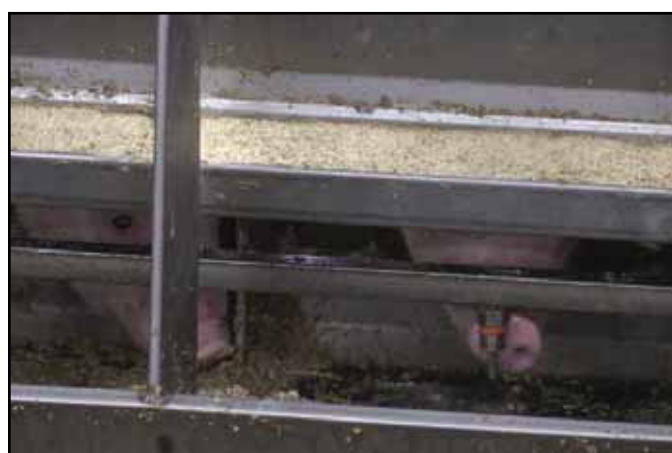
Wet/dry feeders effectively reduce water use by 30% and slurry volume by 20-40%