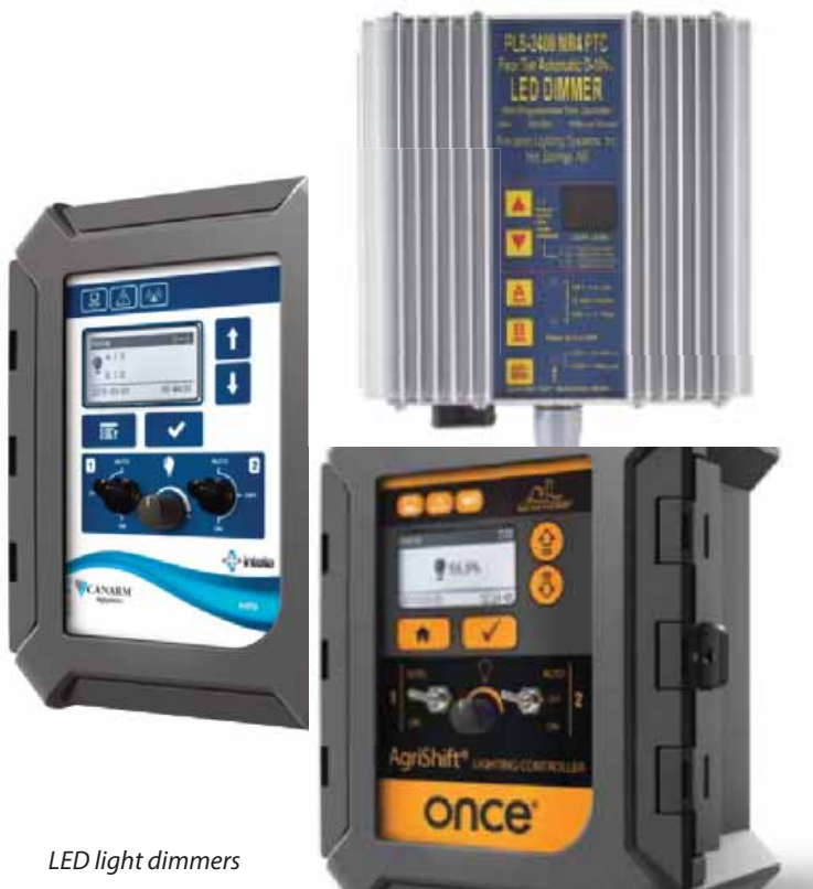
LED light dimmers

LED lights come in a variety of shapes: tiles, tube units, fluorescent tube replacement LEDs (which fit the original fittings, often with the need to remove ballast devices or make other alterations), battens, flexible strips and globelike designs. Many LED lights come with an Edison fitting, so they can be screwed directly into existing light fixtures. All LED lighting systems operate using direct current (DC) with either a centralized AC-to-DC rectifier, or each lamp containing a rectifier within its body and electronics. Many LED lights designed for use in agriculture have heat sinks to remove heat from the semiconductors. In pig barns, it is important to ensure these sinks remain clear of contamination and you clean them between batches so that they operate efficiently - while taking care not to force water into light housings.