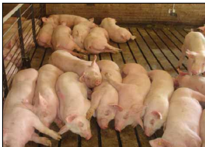
Pigs within their thermoneutral zone sleep side by side without huddling and without moving away from each other

When temperature gets above the upper critical temperature, pigs need to use energy to cool down. Hot pigs will separate from one another and seek out wet parts of the pen - when pigs are warm, they eat less, and growth performance suffers. Keeping a room too hot also wastes energy, increasing energy costs and reducing performance, temperature control is therefore important. Table 4 shows the recommended setpoint temperatures during the heating season for various ages of pigs.