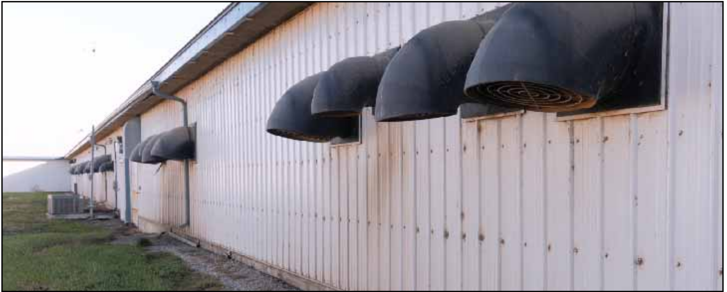
Exhaust fans with wind hoods

The goal of a well-managed ventilation system is to limit moisture and gas accumulation in the winter and heat in the summer. Too little ventilation results in low air quality - too much ventilation wastes energy. Ventilation systems use a lot of energy, especially the fans, with the finisher barn accounting for approximately 60% of all energy consumption. You can calculate electrical energy cost of a fan using the following equation: