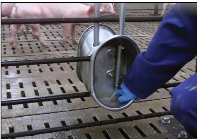
Bowl drinkers can reduce the amount of water wasted by 10-15%

Energy is used when slurry is pumped from the barn to the outdoor storage facility, when slurry is agitated in the storage facility, and when slurry is loaded and transported for field application. The more slurry there is, the more energy is needed for these processes, resulting in higher energy costs. When pigs waste a lot of water, it increases slurry volume. In other words, you're basically paying to get clean water moved out of your barn to the field. Reducing water wastage from drinkers is, therefore, a good way to reduce both the water bill and the energy bill.