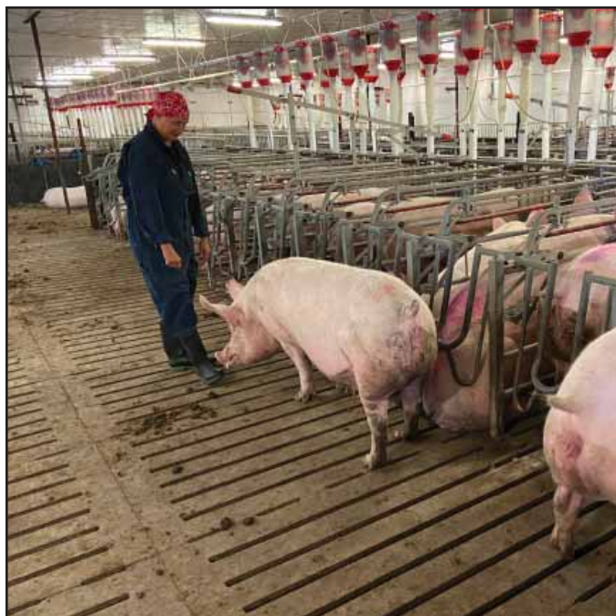
Group-housed gestating sows can handle lower temperatures than the recommended temperature setpoint of 17°C.

Pigs prefer a diurnal pattern for environmental temperature with a preference for higher temperatures during the day when active, and lower temperatures at night taking advantage of huddling while sleeping. Research at the University of Minnesota showed that it is possible to drop the nighttime temperature after day five in the nursery room by 8.3°C without affecting growth performance. This resulted in a 30% and 20% savings in heating fuel and electricity use, respectively. Research at PSC showed that when given a choice, early-weaned piglets chose warmer temperatures during the day and lower temperatures at night. Another trial showed that grow-finish pigs could handle daily temperature fluctuations up to 13°C without affecting growth performance as long as this fluctuation is through a slow and steady change and mean daily temperature is within the optimal range. These trials show that there are opportunities to reduce energy use by reducing the temperature setpoints at night below the optimal or desirable temperatures for nursery and grow-finish pigs. It is very important to ensure there are no abrupt temperature fluctuations.