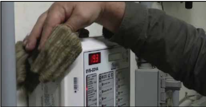
You can use compressed air or a cloth to clean thermostats and controllers

Gas leaks can be a major cause of increased energy costs. The most common point of leakage is where the line enters the barn, due to corrosion caused by the wide temperature differences. Make sure to do a high-pressure test of your gas lines once a year. Generally, your propane supplier can do this test at no charge.