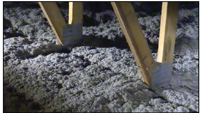
Insulation in the attic

Energy conservation is a good reason to consider high levels of insulation. Insulation will reduce fuel requirements in terms of heating in cold weather and minimize solar gain/temperature rise in warm weather. Well insulated buildings are easier and cheaper to ventilate, is a good rule of thumb.