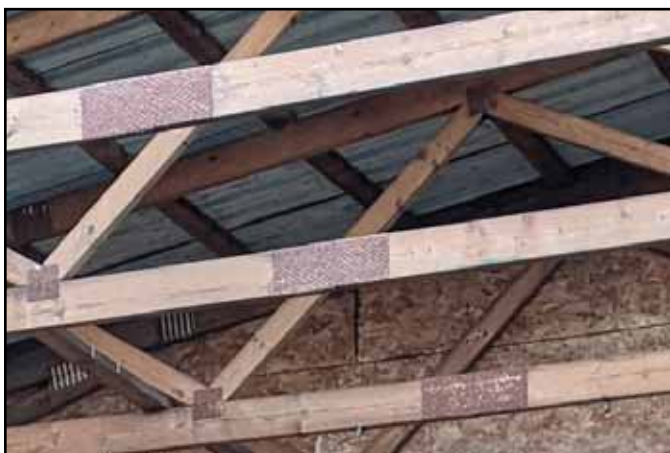
Ensure there is no corrosion on brackets, truss plates, pins and rafters