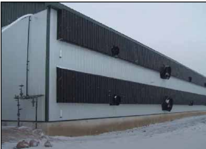
Example of a barn with a transpired solar collector, also called a solar wall

A simpler and much cheaper way to use the sun's power is by using a transpired solar collector, also called a solar wall. A solar wall converts the sun's energy into heat, through a typically dark-colored wall made entirely of metal sheeting with thousands of micro-perforations (tiny holes) in the surface. This wall is mounted to the building's structural wall, creating a 4-to-6-inch gap between the two, generally covering the south, west or east side of a barn. The solar wall sits over winter air intakes; air heated up on the surface of the dark wall is drawn through the micro-perforations by ventilation fans, increasing air temperature by as much as 22°C. The heated air flows to the top of the wall and is then distributed to the barn's interior through conventional ductwork. Solar walls can reduce heating cost up to 30% by using the sun's energy to heat incoming ventilation air, while improving indoor air quality and decreasing humidity. Systems have an estimated life span of 30 years, and a payback period of 3 to 12 years; payback is dependant on climate and type of fuel displaced.