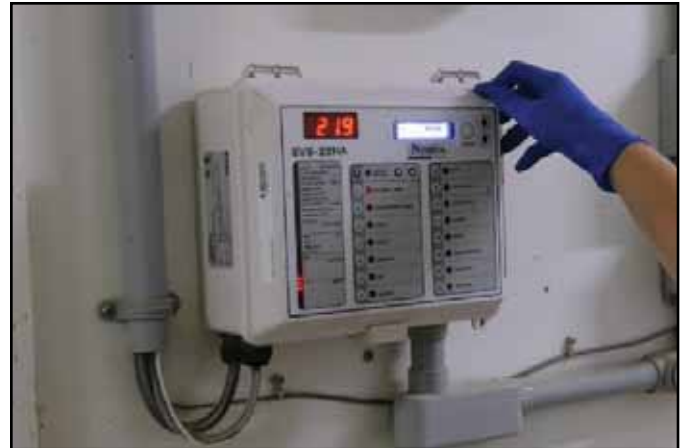
Controller for an individual room