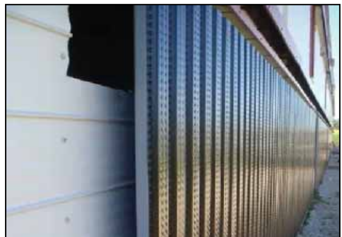
Close-up of a solar wall