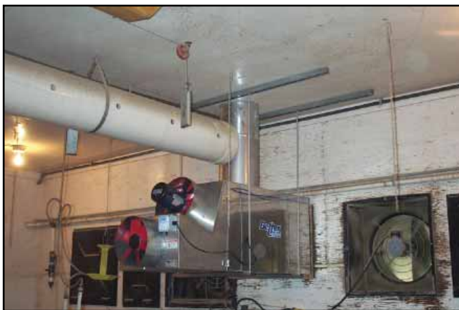
An air-to-air heat exchanger installed at Prairie Swine Centre

Producers should consider the advantages and disadvantages to this system and then decide whether it is right for their operation.