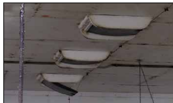
These air inlets should be adjusted and calibrated to introduce air uniformly

Air inlets. Good inlets introduce air uniformly, direct winter air along the ceiling, are adjustable and require very little energy to operate. Self-adjusting air inlet baffles require no energy at all. Ensure inlets close tight enough to maintain negative static pressure across the fan. An air inlet velocity of 4 m/s to 5 m/s is desirable to prevent overloading of exhaust fans, which decreases output and energy efficiency. Often inlet adjustment and maintenance can accommodate changes or fluctuations in barn temperature. Instead of checking inlets, a common mistake is to increase ventilation rate to lower barn temperature and thus increase energy consumption.