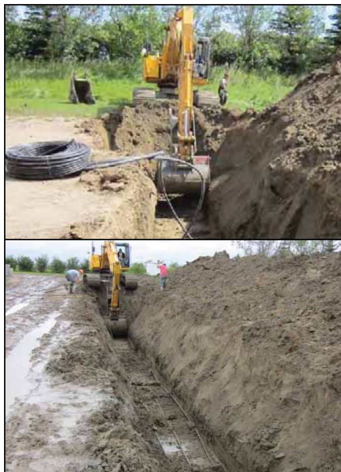
Building of a trench with a horizontal loop of polyethylene pipes as part of the Prairie Swine Centre geothermal system

The project compared energy consumption (for heating and ventilation) in this room to a standard grow-finish room with a conventional gas-fired heater. Results showed the room with the geothermal system consumed about 45% less total energy for heating and ventilation during the cold season compared to the conventional room. The mean air temperature, relative humidity, and air quality within the two rooms were relatively similar during winter season. During the summer season, the use of the geothermal system to cool the room resulted in larger energy use compared to the control room, mainly for the operation of the heat pump. Levels of greenhouse gases (methane and carbon dioxide) were significantly lower in the geothermal room than in the room with the conventional gas-fired heater during both heating and cooling periods.