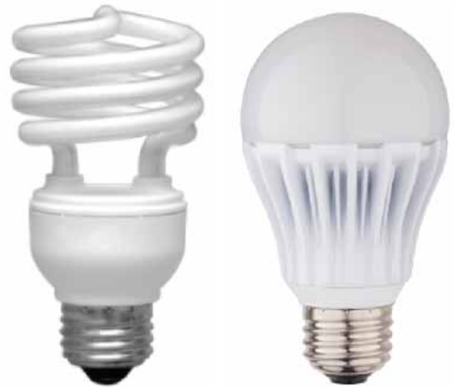
Energy efficient light bulbs. Left - compact fluorescent lights (CFLs); Right - light emitting diode (LED).

LED lights are becoming very popular not only due to their high-energy efficiency, but also thanks to their long life and low maintenance cost. The expected life of LED bulbs is 50,000 to 100,000 hours, as opposed to 24,000 hours for fluorescent and HID lamps.