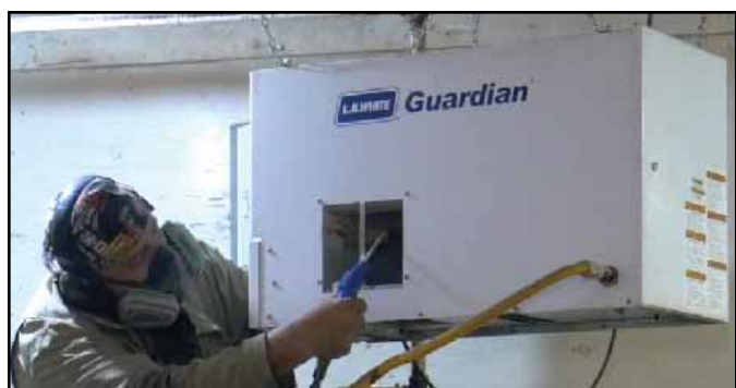
Forced air heater

Heating costs is the largest component of total energy costs in pork production. On average, space heating contributes 95% of natural gas consumption in a hog operation. While natural gas is by far the most common fuel source used for space heating of hog operations, propane or biomass are also options. Heating systems must work in coordination with ventilation systems to provide a good environment for people and pigs. The most common systems for adding heat to the indoor environment are forced air heaters, infrared radiant tube heaters, hot water heating (consisting of a boiler, circulating pump, distribution piping and radiators in the space to be heated), and electrical devices such as heat lamps and heat pads. Table 6 outlines the heating requirements for each stage of development.