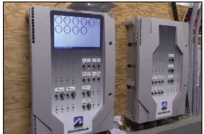
Centralized controller system for an entire barn